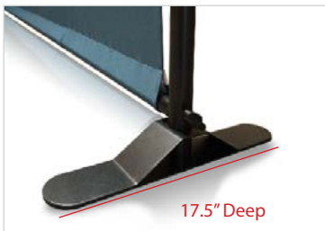
Sturdy Steel "Bridge" Support Base.